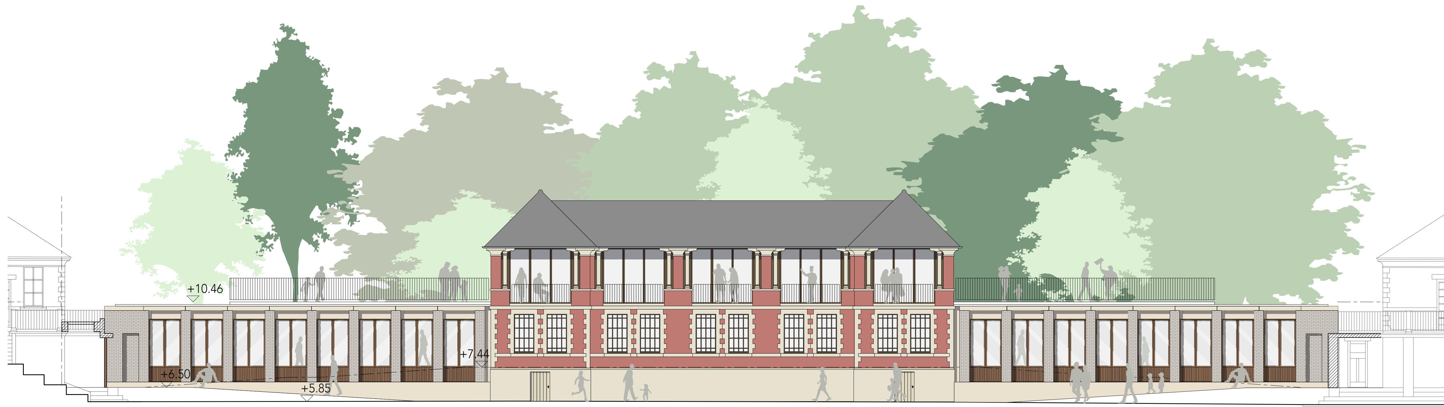
2 Lido (East) Elevation